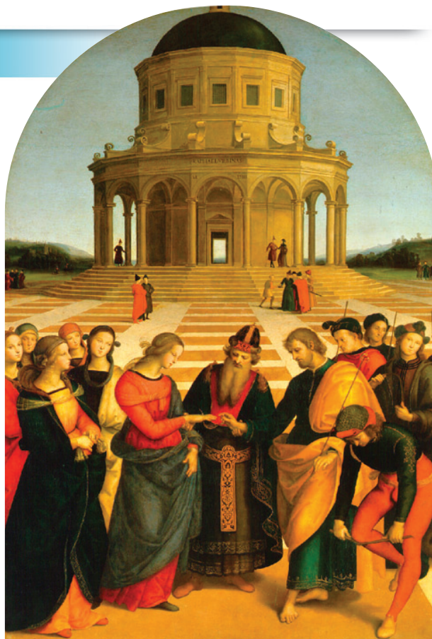
Marriage of the Virgin (1504), Raphael